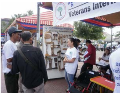
VIC exhibit at the International Day for PWDs

➔ VIC participated in the National Ceremony of the International Day for Persons with Disabilities on December 3 rd . The ceremony was attended by approximately 3,000 individuals and was presided over by Her Excellency Men Samon, Deputy Prime Minister.